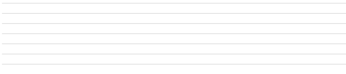
Chart One – Ethnicity of applicants in 2023 compared with the population of Crawley.

- People who describe their ethnicity as black, mixed or from multiple ethnic groups, and other are overrepresented when compared with the population of Crawley, see Chart One. This is in part due to approaches from people relocating from other countries who wish to live in the UK, including former refugees and asylum seekers who have been granted permission to remain in the country.